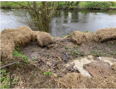
Wharfe Sewage Spill

We are delighted to hear that the Wharfe in Wetherby has been granted "bathing water" status. The monitoring point will be near the bandstand beside the Wilderness Car Park. This means that samples from the river will be analysed more frequently NOT that the water is suitable for bathing! It is, however, a first step towards improving water quality. We had previously provided a letter of support for the application.